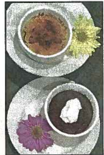
Creme Brulee, top, and Chocolate Pot De