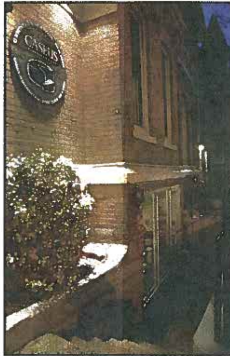
The exterior of Caseus, the new cheese shop on the corner of Trumbull Street and Whitney Avenue in New Haven.