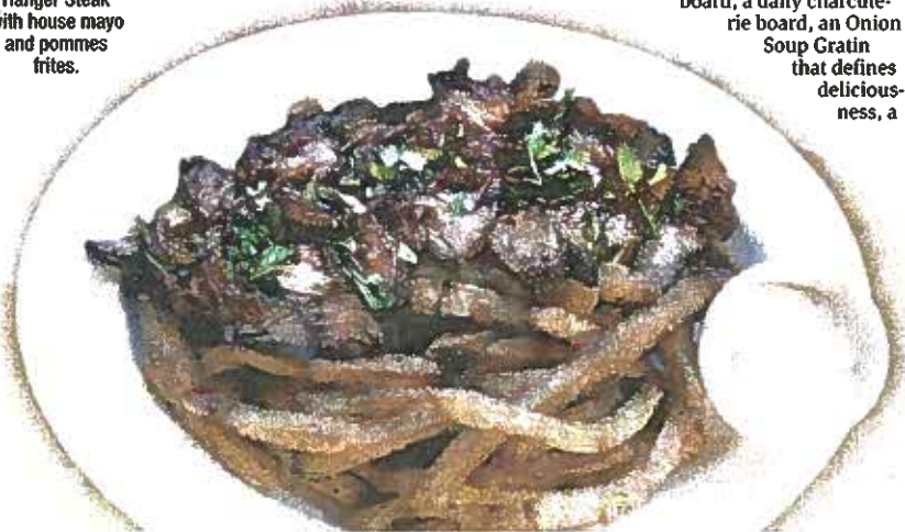
Hanger Steak with house mayo and pommes frites.