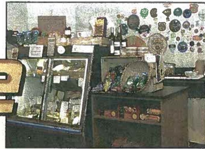
Caseus, besides being a bistro, also sells various cheeses.