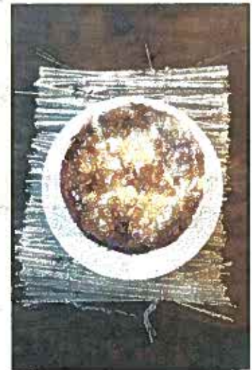
Onion Soup Gratin.