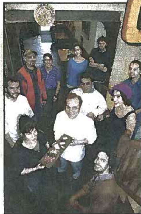
The staff of Caseus with some of the cheeses available.